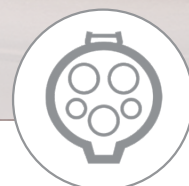
SAE J1 772 (Type 1)